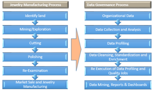
Figure 1 : Governance process mapping in jewelry and data

Figure 1 demonstrates the mapping between various processes involved with respect to jewelry manufacturing and data management